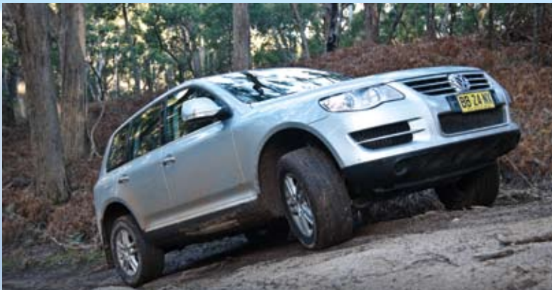
On this slope the Touareg's stiff suspension could not apply sufficient weight to the wheels to permit progress without the traction control needing to assist.