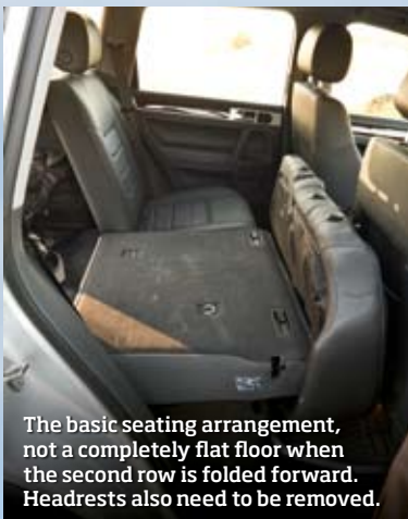
The basic seating arrangement, not a completely flat floor when the second row is folded forward. Headrests also need to be removed.