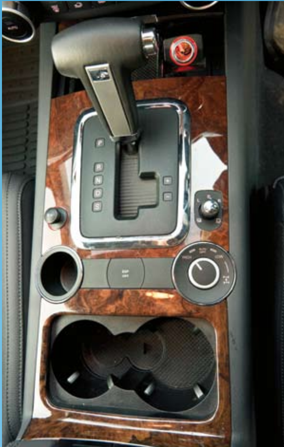
The auto has a sports mode, and a manual shift mode. ESP can be disabled and is off in low range. Like all modern vehicles the centre diff is an electronically controlled clutch, so it's not locked per se in high range. There are two 12v sockets in the front, one in the second row and one in the rear.

up top. The second row folds forward in a 60/40 split, but not quite flat. Still, there should be more than enough space for a pair of travellers.