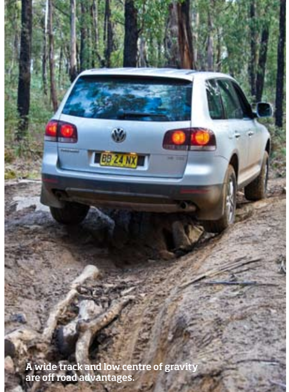
A wide track and low centre of gravity are off road advantages.

than the LC200, and the wheelbase is also longer than the big Cruiser although it's a shorter vehicle and not as tall, so it looks smaller than it is. The suspension tune also manages to deliver a comfortable ride in every condition we experienced, helped by the 255/60/17 tyres – lower-profile rubber would be harsher.